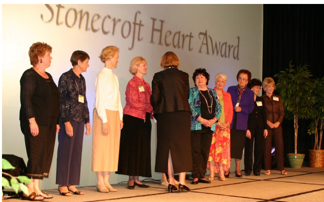
Volunteers are supported, equipped, and encouraged through Stonecroft Ministries. The Stonecroft Heart Award annually recognizes top volunteers.