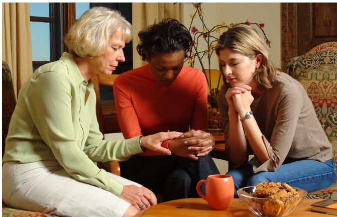
Individually, in small groups, and corporately, Stonecroft staff and volunteers rely on God through prayer for wisdom, creativity, and guidance in carrying out the mission.

Volunteers understand well the power of prayer and take advantage of “Prayer Connections.” During this time, worship of God and intercession for communities, families, and friends takes place, as well as prayer for local outreach efforts, Stonecroft volunteers and staff, Village Missions, and personal needs. It is Stonecroft’s belief that Prayer Connections help each group gain a greater vision for outreach.