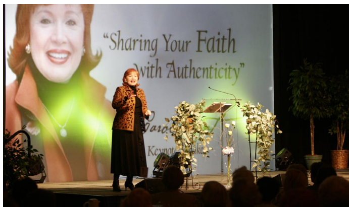
Stonecroft hosted "IMPACT '06—Equipping for Evangelism" in Kansas City this year. More than 850 women and men gathered to focus on sharing their faith.

and stages of life. Programs change. Personnel change. Materials are updated.